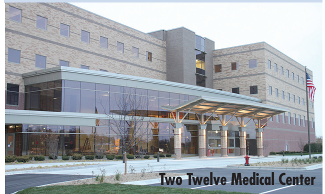
Two Twelve Medical Center

For more information about Ridgeview's accreditations, awards and honors, visit www.ridgeviewmedical.org/quality .